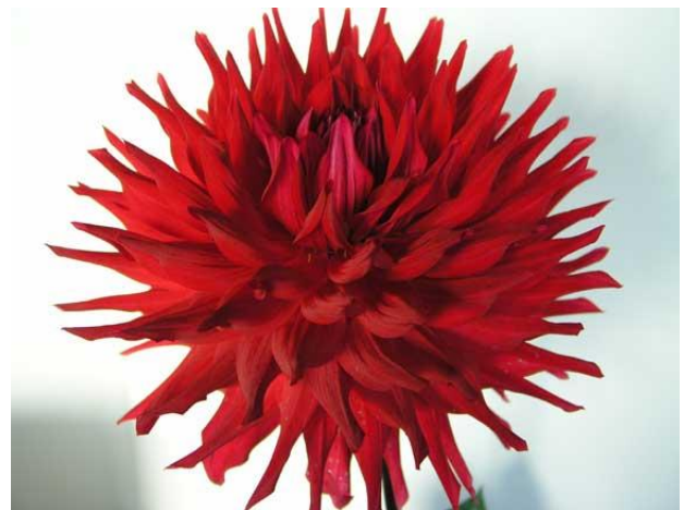
Clearview Claret Photo

Do try to manage healthy plant growth by allowing only one sprout to grow from each tuber. If multiple sprouts are allowed to grow, they tend to compete with each other resulting in smaller flowers and generally weaker growth. Don't remove the unwanted sprouts by pulling on them. I did this at one time, until I managed to break the neck of the only tuber of a new and expensive variety. Pinching or cutting works fine. Pulling, a definite no-no.